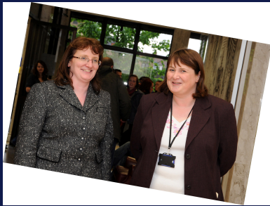
Annual Public Outreach Lecture