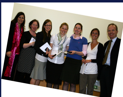
Medical Schools Competition