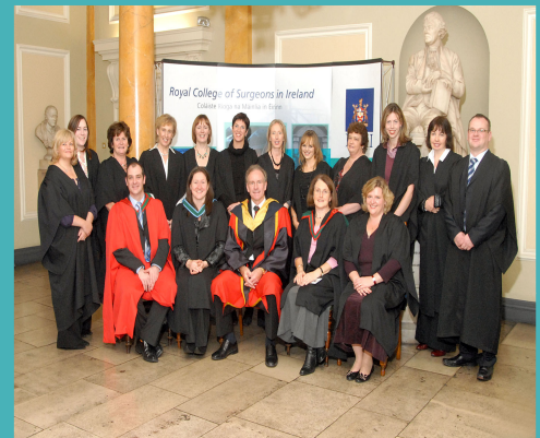
Conferring Ceremony of the Nurse Prescribing Ceremony

Such is the success of the programme, the Minister for Health and Children, Mary Harney recently complimented the School of Nursing on their proactive and innovative approach to delivering nursing education in the current climate.