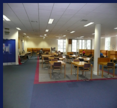
Library Level One

The service desk has been modified so that staff are more visible to people as they come in. Come over and visit and see the new layout for yourselves!