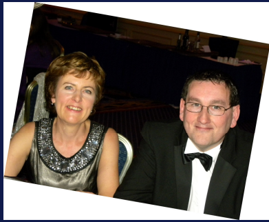
Chamber Ireland Awards