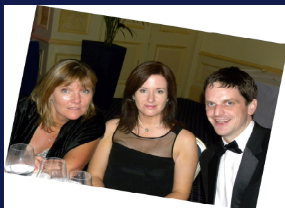
Chamber Ireland Awards