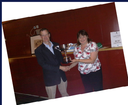
RCSI Golf Society's Prize