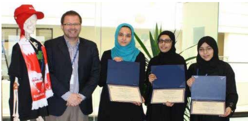
Three N2 students were recently presented with Certificates of Achievement from the Centre for Student Success in recognition of completion of a 4-part Writing and Grammar Course.